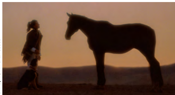
@kinbykin/ Kin chan coedel