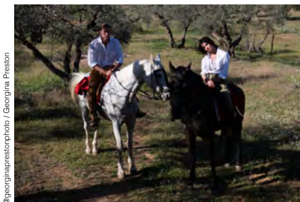
@georginaprestonphoto / Georgina Preston