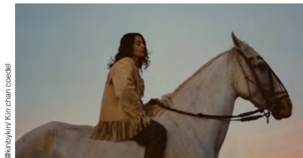
@kinbykin/ Kin chan coedel

In a world where luxury is often confined to the predictable, the Riding Safari Club (RSC) stands as a beacon for those who crave adventure and authenticity. RSC is not just a travel company—it's a movement, a lifestyle that celebrates the power of horses, the beauty of the natural world, and the rich cultural tapestry of the regions it explores. This year, the club is setting its sights on one of the world's most mystical and untouched regions: the Middle East and the Arabian Gulf - worlds where the horse is still king.